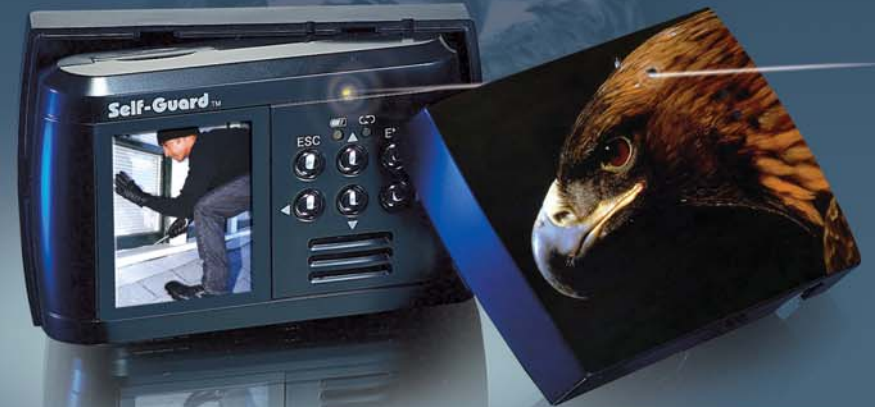
Subminiature Size (Less than a Cigarette Pack)

(Professional Version) SG-1000, SG-2000, SG-3000